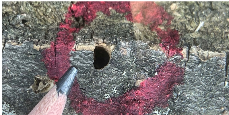
D-shaped emergence hole