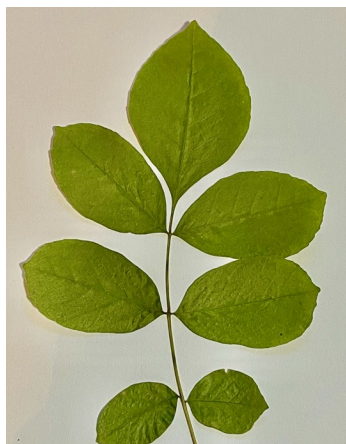
Oregon Ash leaf