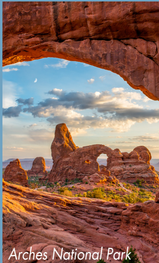
Arches National Park

Tabernacle, the State Capitol, and the University of Utah. Visit three national parks (Arches National Park, Canyonlands National Park, Capitol Reef National Park), stay in Moab, Utah, visit Dead Horse Point State Park, Canyonlands by Night Cruise, Park City, take a Monument Valley Scenic Drive Tour, have lunch at Goulding's Lodge, visit Goulding's Museum and Trading Post, enjoy