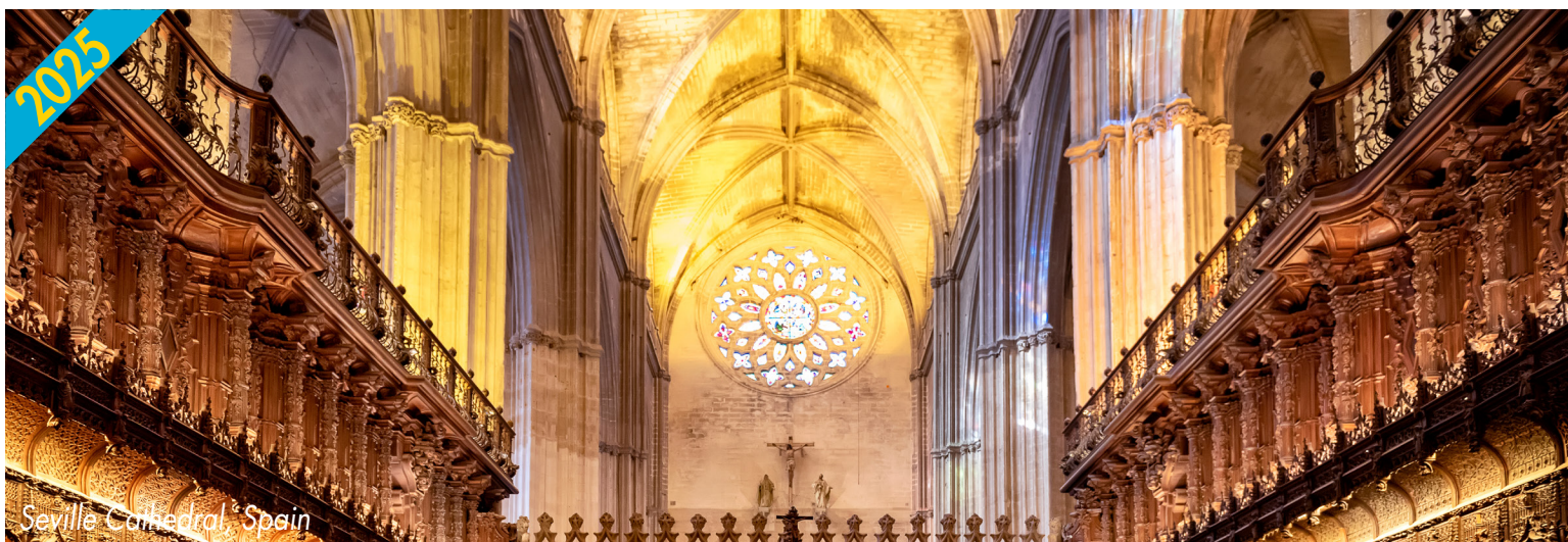
Seville Cathedral, Spain