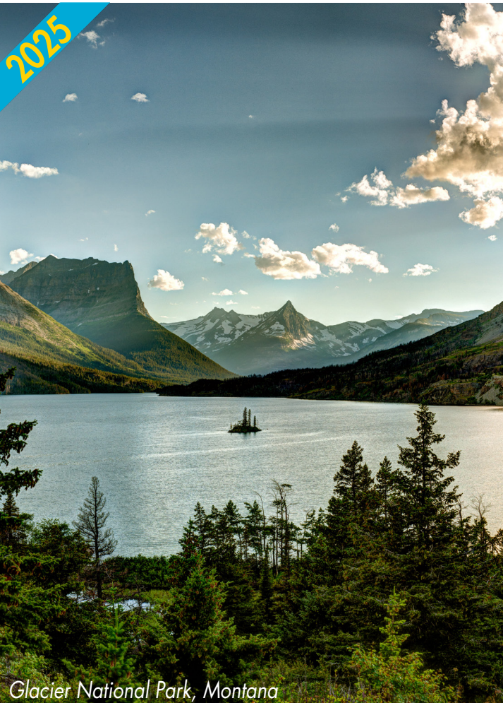
Glacier National Park, Montana