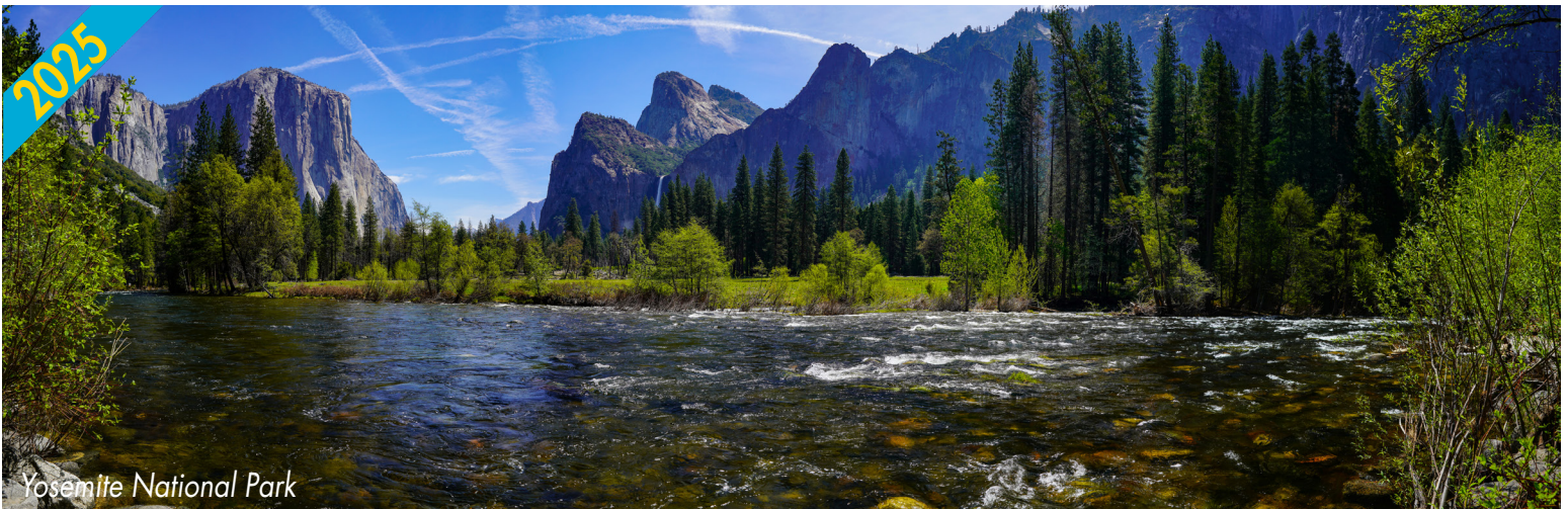
Yosemite National Park