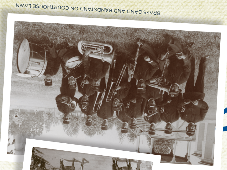
BRASS BAND AND BANDSTAND ON COURTHOUSE LAWN

As Hillsboro grew larger, conflicts arose. The concentration of saloons that had given it the nickname "Sin City" contrasted sharply with more refined influences: brass bands; literary societies; fraternal groups; and temperance societies. The town changed physically as well. By the 1890s, Main Street was planked and new buildings were built from brick rather than timber by order of the City Council. Agriculture remained the foundation of the city economy, and stallion fairs were a