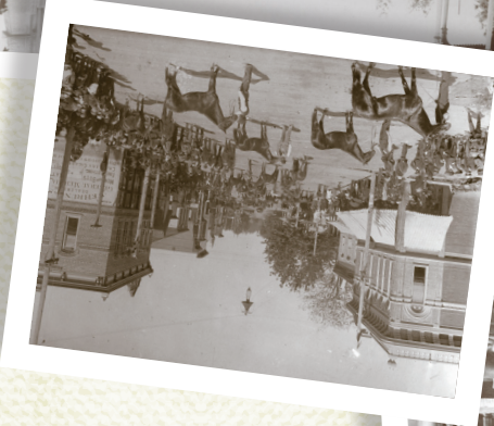
MAIN STREET STALLION PARADE 1895

Downtown changed dramatically in the early 1900s, with the arrival of the first and second "interurban electric" trains. The Oregon Electric arrived on Washington Street 90 years before MAX opened on the same alignment. Southern Pacific's "Red Electrics" ran on Main Street. Both trains shared the streets with the new "horseless carriages." The interurbans ran for 30 years before falling victim to the Great Depression. By World War II, Hillsboro's population had grown to over 3800, but it jumped by over a third in the next decade, as war industry workers from Portland settled in the community. After the war, automobiles had replaced horses as the main mode of transportation, but downtown remained the center of the community.