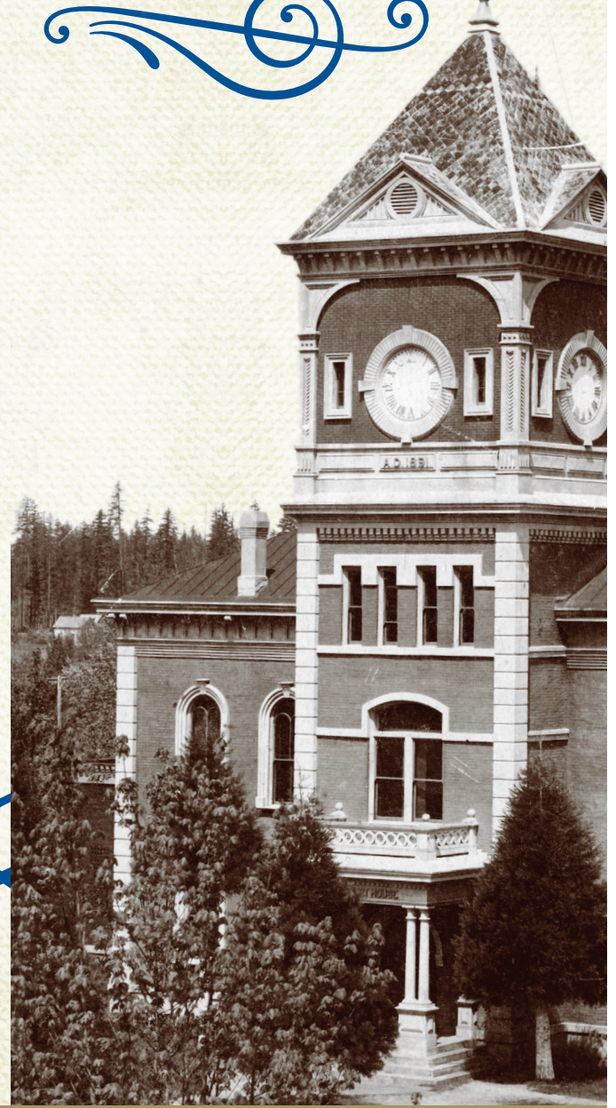
COUNTY COURTHOUSE • 1895