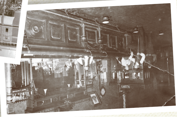
popular event on Main Street.

As Hillsboro grew larger, conflicts arose. The concentration of saloons that had given it the nickname "Sin City" contrasted sharply with more refined influences: brass bands; literary societies; fraternal groups; and temperance societies. The town changed physically as well. By the 1890s, Main Street was planked and new buildings were built from brick rather than timber by order of the City Council. Agriculture remained the foundation of the city economy, and stallion fairs were a